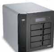
DNS-1250-04 Share Center Unified 4 Bay DNS-1250-04