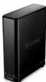
DNS-315 Share Center 1-BAY SATA Network Storage

Ease of Use, support Mobile device and Cloud access | IP Camera support for home surveillance