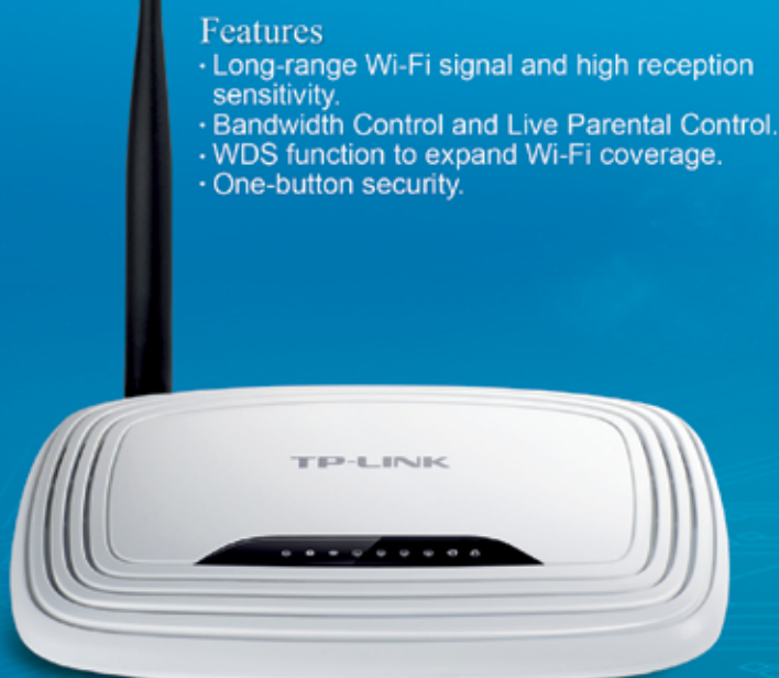
150Mbps Wireless N Router