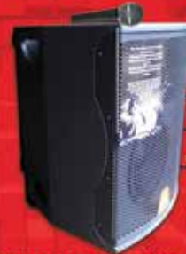
PUNTA SP-A188 MRP : ₹ 14,990

Imported and distributed by: Bayside Global Electronics Pvt. Ltd. 15-India Exchange Place, 1st Floor, Kolkata (WB) India-700 001 Email : sales@baysideglobal.com , Web : www.baysideglobal.com , For Sales & Other Inquiry Call: +91 81000 88088