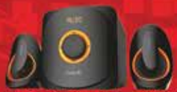
HV-SF4210U MRP : ₹ 2999