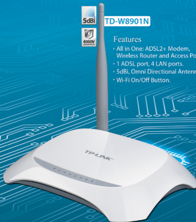
150Mbps Wireless N ADSL2+ Modem Router