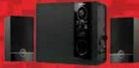
HV-SF2210U MRP : ₹ 2499