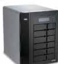
DNS-1250-06 Share Center Unified 6-Bay Storage