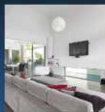
Extensive Coverage at Home