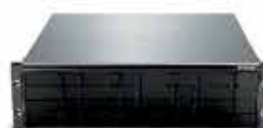
DSN-4100 16-Bay iSCSI SAN Array with 4GbE data ports & 512MB cache