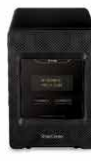
DNS-345 Share Center + 4-Bay SATA Network Storage Enclosure