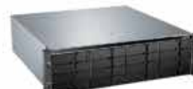
DSN-4200 16-Bay iSCSI SAN Array with 8Gbe data ports & 1GB cache

Contact D-Link Storage Principal Partners