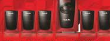
HV-SF9991U MRP : ₹ 4999