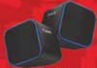
HV-SK473 MRP : ₹ 499