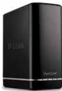
DNS-320L Share Center 2-Bay SATA Cloud Network Storage Enclosure