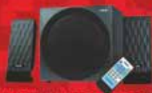
HV-SF5510U MRP : ₹ 3499