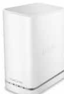
DNS-327L Share Center + 2-Bay SATA Cloud Network Storage Enclosure